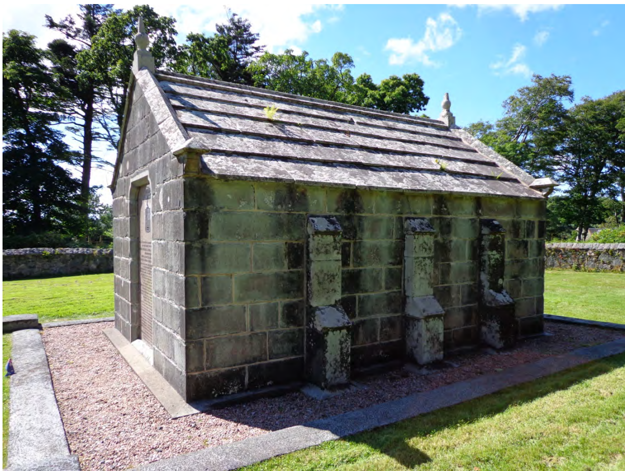
Mausoleum of Lachlan Macquarie on the Isle of Mull, Scotland, 2014.

We are understandably proud of our Governor and regard it as our responsibility to ensure that his last resting place is properly maintained. The building is in reasonable order and only seems to have one or two opportunistic plants growing out of the slate roof. The grounds are well maintained and I feel sure that it receives regular attention.