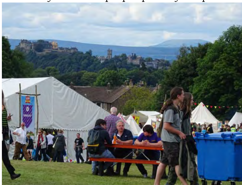
Bannockburn, Stirling 2014

On Monday I managed to get a very special spot in the Visitor Centre and was able to play the war game. I was placed on the English side to re-play the battle, so naturally, the English won. I am not sure I am happy with this outcome.