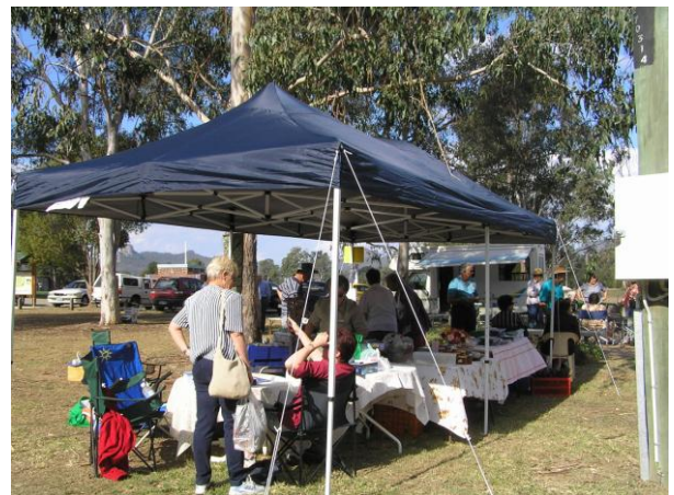
Right: Our stall, nicely protected by our new Clan Tent.