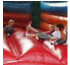
What fun in the jumping castle!!