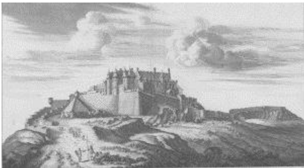
Stirling Castle (right circa 1360)