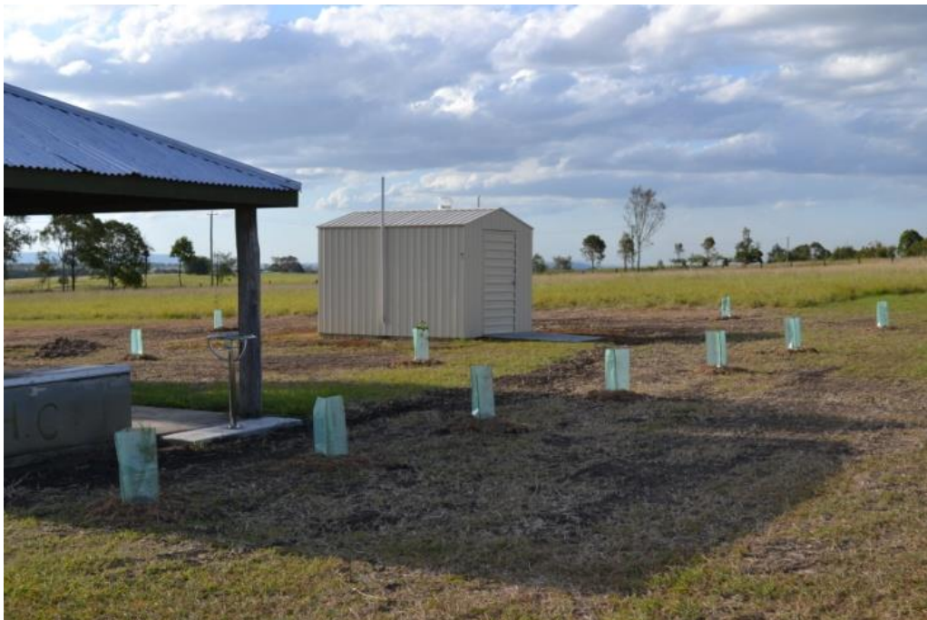
Newly Constructed Amenities block and water bubbler adjoining to existing shade shelter.

All Clan Forsyth members are therefore cordially invited to attend the official opening ceremony to mark the completion of this major Clan project. The ceremony is to be held at 11.00 am on Saturday 6th June 2015 , at the cemetery grounds near Harrisville. The Clan will be providing light refreshments afterward for all attendees.