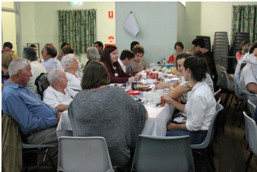
Taking the time to share a meal and just catch up with family and friends

All those both young and old who came and joined us once again, had the opportunity to only enjoy the famous traditional country food and great entertainment but they also had a chance to catch up with kith and kin.