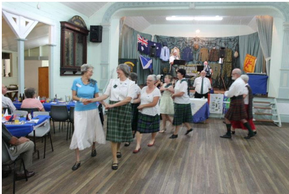
Demonstration Dance by Scottish Country Dancing Troupe

The dinner guests were then instructed how to perform Scottish Country Dance. Eight intrepid dancers were piped onto the dance floor to provide us with a demonstration of fine Scottish County Dancing.