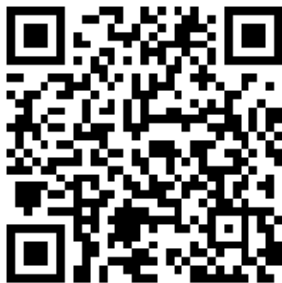
Clan Journal May 2015

To use QR codes conveniently you must have a smartphone equipped with a camera and a QR code reader/scanner application feature. Luckily, the newer smartphones models available today often have an app pre-installed on them.